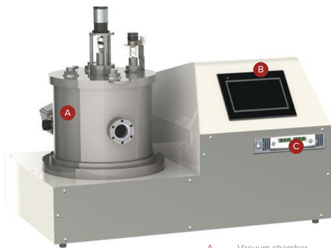
A Vacuum chamber B Touchscreen HMI C DC power supply